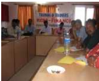
Learning by doing: Participants engaged in group work