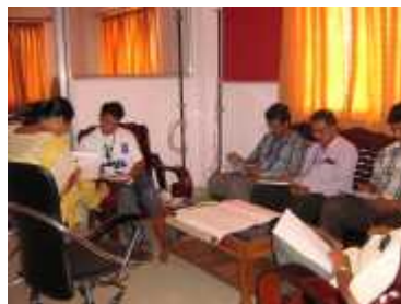
Participants of the training Programme