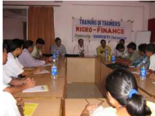
Joint Director of Misson Shakti, Govt. of Orissa is inaugurating the function

create barefoot trainers on micro-finance. Accordingly, the participants were oriented on trainer’s skill and the subject knowledge on micro-finance. Initially the training programme was kept for 9 days. Looking at the comfortability of both participants and organization, later the programme got reduced to 7 days. However, the design of program and content were well accepted among the participants. Moreover, the training programme got vehement responses from all over the country and the participants from all parts of the country participated in the training programme. Initially participants from 18 organizations across the country participated. The in-house resource person had conducted the training programmes and it supported by the external resource persons. Based on the success of the programme, Shristi wanted to conduct the same training programme in the next calendar year.