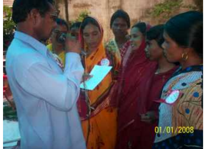
Performance and Equity are the major wheels in the progress of community institution: Oath taking ceremony among the Directors of the Cooperative