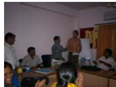
Certificate distributed to acknowledge participation and completion of course