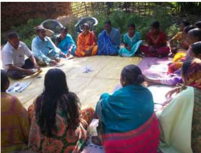
Cluster Coordinator engaged in dialogue with the women members on functional aspects of the group

At present, Shristi has the direct presence in 134 villages in 3 blocks of Dhenkanal district and one block of Keonjhar district.