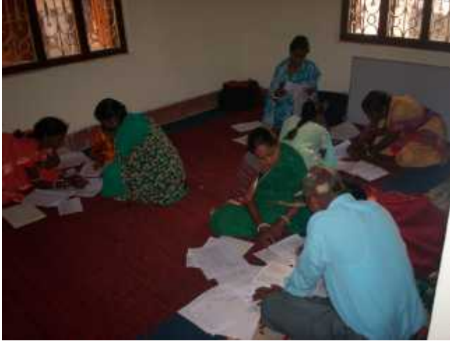
Transparency is the factor of survival: Accountants engaged in learning accounting tricks and record maintenance to achieve transparency