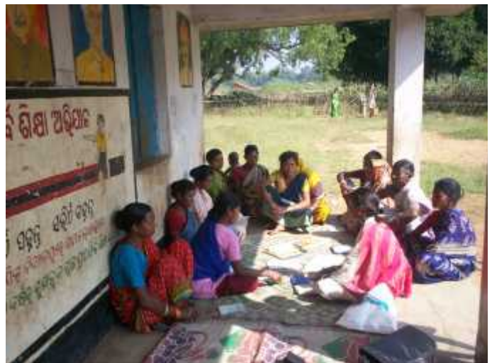
Future security lies in Savings: Constituency wise savings collection in nearby primary school